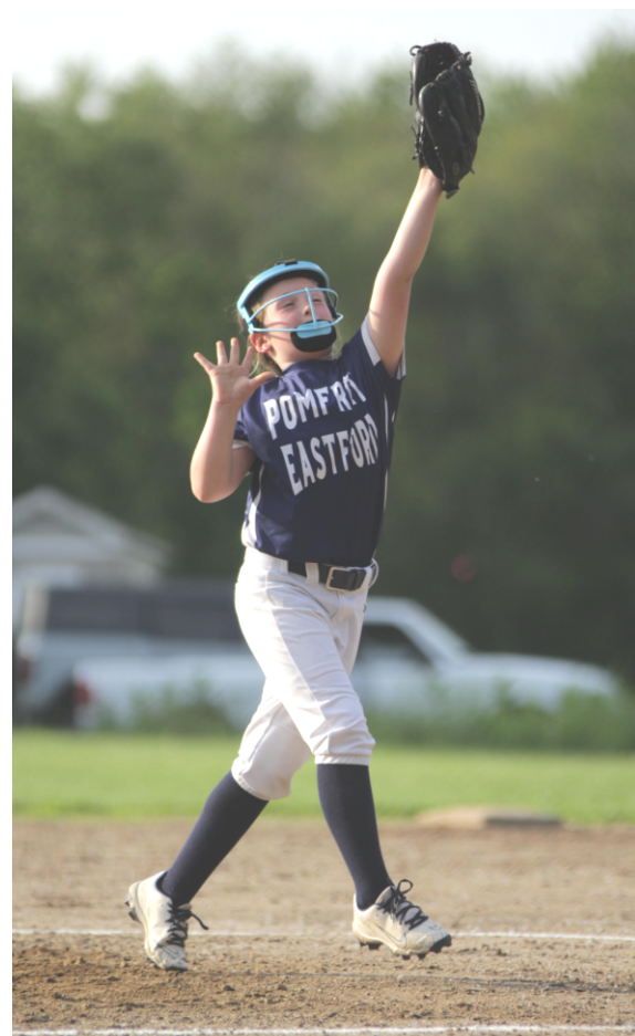
The Navy Knockouts 8-10 Softball team had a season full of fun and growth, going 5-8 in the regular season and advancing to the second round of the playoffs before falling to Putnam.

Looking ahead, registration is currently open for our Fall Ball 2025 season. The PELL board is working closely with the Town of Eastford and their field maintenance committee on future improvements to Bowen Memorial Field. We're also in the beginning stages of planning for our haunted house fundraiser, Nick's Nightmare, which takes place in October at Pomfret Little League Fields. This event is executed in collaboration with our amazing partners, New England Laborers Training Academy, and all proceeds benefit Pomfret Eastford Little League.