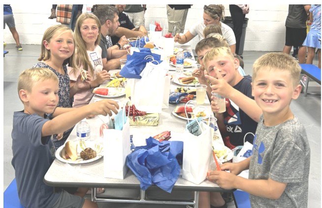
Families enjoy the end-of-week barbeque.