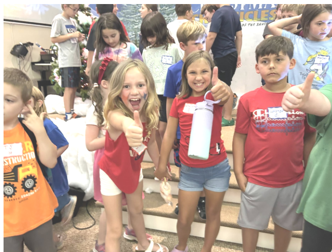
Kids show their excitement as VBS begins.

EASTFORD — Eastford Baptist Church hosted its annual Vacation Bible School (VBS) event Monday, July 28 through Friday, Aug. 1. The weeklong event, called "Christmas Chronicles," had more than 80 kids registered. The week aimed to provide a five days of fun while also teaching kids about the Nativity story. During the week, a Penny War/Food Drive was held to benefit the Eastford Food Pantry. It total, the children raised $700 for the pantry, as well as more than 400 food items. The week ended with a Family BBQ on Aug. 1 that celebrated the week that was. Courtesy photos