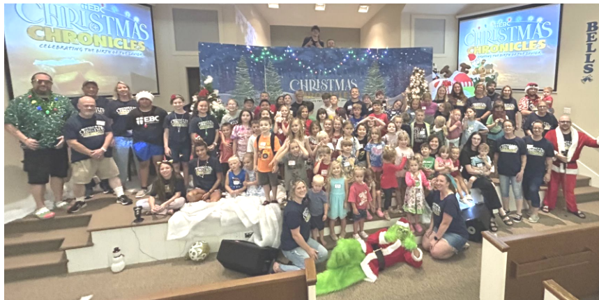
Kids gather for a group picture on Thursday, July 31.