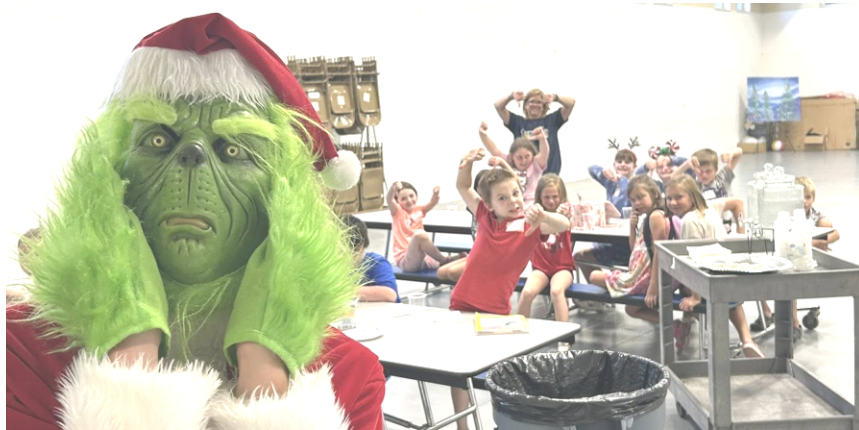
"The Grump" was booed out of the building during snack time.